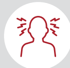
Altered mental status